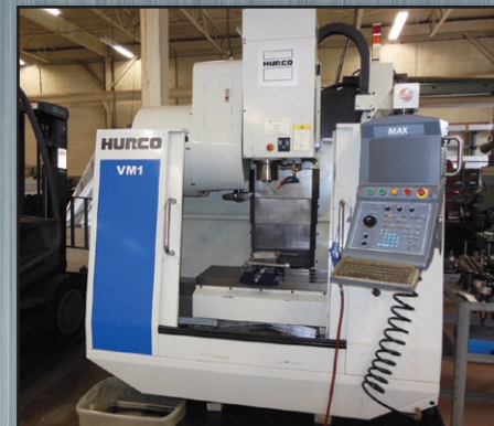
Hurco VM1 VMC (2005)