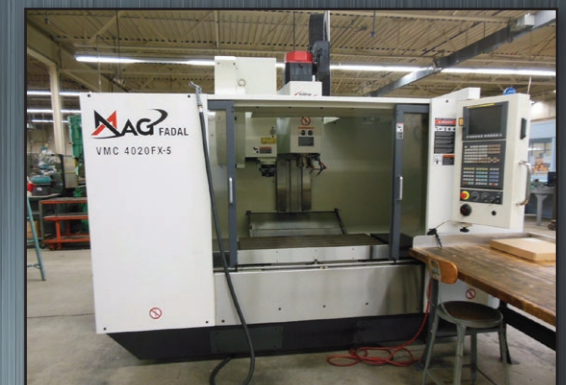
Fadal MC4020FX-5 (2007)

ONSITE & ONLINE PUBLIC AUCTION Assets of: Dynak, Inc. 33 Saginaw Drive, Rochester, NY 14623 TUESDAY, JULY 14TH 10:00 AM Inspection: Monday, 7/13 9:00-3:00 PM & Sale Day Beginning @ 8:30 AM