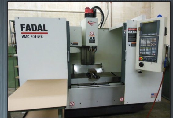
Fadal VMC-3016FX (2007)