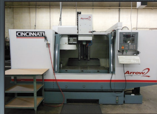
Cincinnati Series 2 Arrow VMC