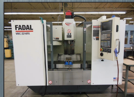
Fadal VMC 2216 FX (2007)