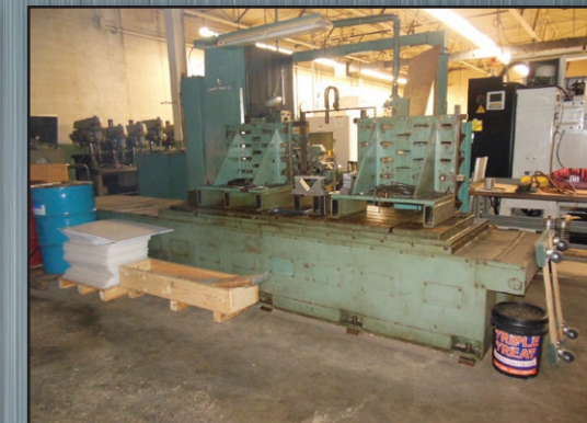
Cincinnati 2H-40 NC Horizontal Mill