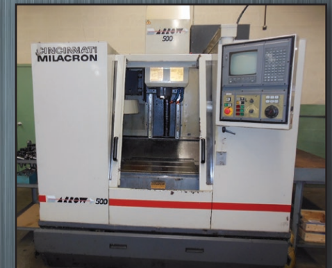
Cincinnati Arrow 500 CNC VMC